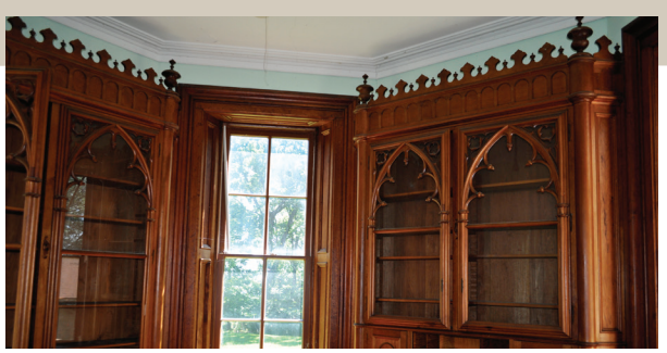
The first floor library exemplifies the beautifully crafted Victorian architectural details found throughout the castle.

Renovation and rehabilitation of the castle building began in 1998 with roof replacements and window repairs, including the import of authentic period glass from France. Mortar restoration was completed in 2000, and construction of porches that followed the original exterior design completed the return of Cooke Castle to some of its former glory.