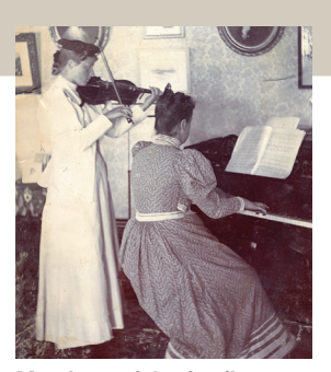
Members of the family were musically talented and often performed for guests.